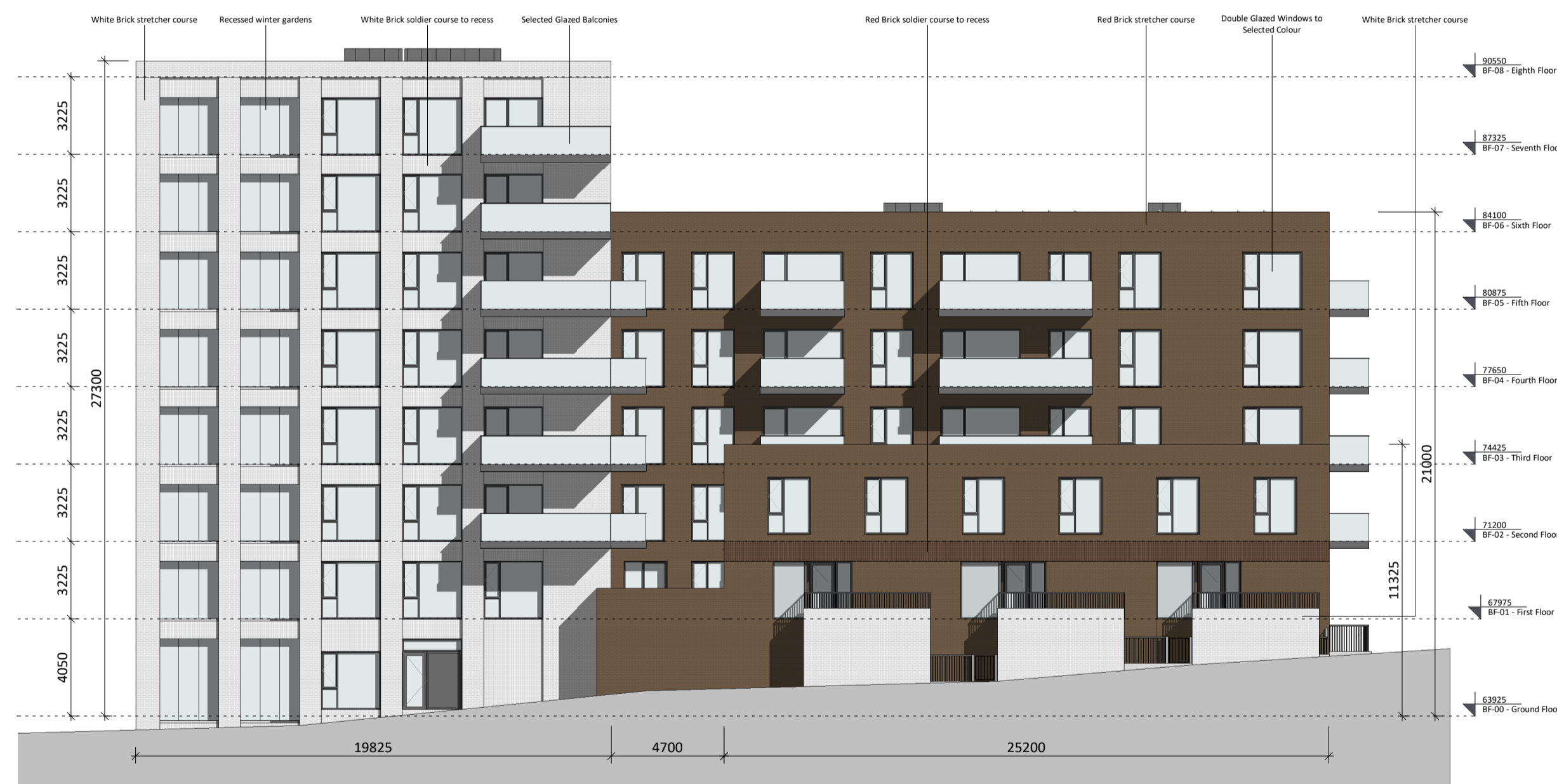
④ Block F West Elevation 1:200