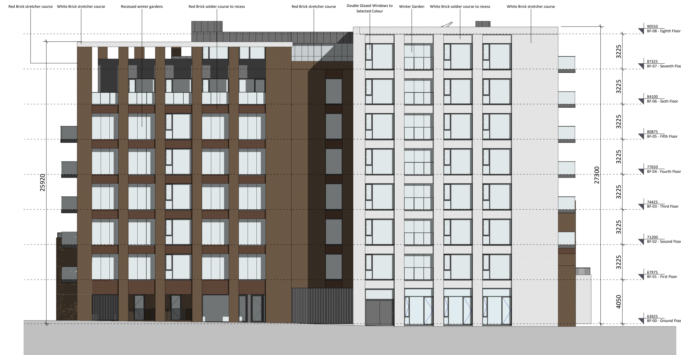
② Block F North Elevation 1:200